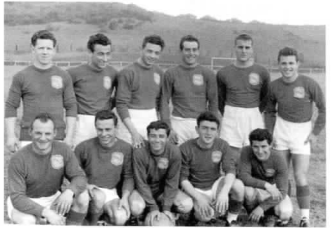
A.P.I.A. Soccer team, 1955.