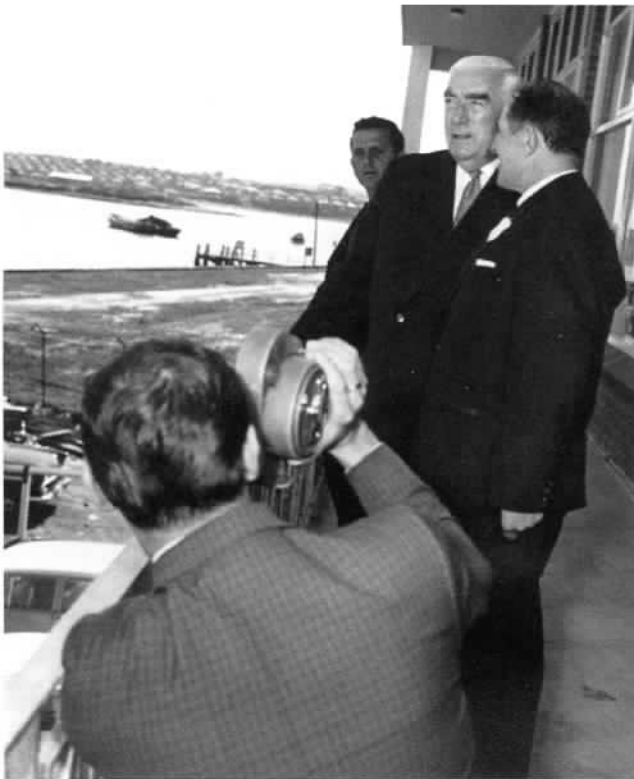
The Prime Minister, Sir Robert Menzies, on the balcony of the A.P.I.A. Club, overlooking Iron Cove bay, on the day of the official opening of the Clubhouse.

Let everyone have the benefit of what you can contribute and you get the benefit of what they can contribute, an integrated Australian society' (as reported in Il Globo , 26 September 1967, pp. 34-35).