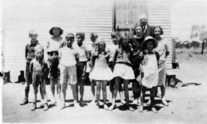
The home at Mt Monger.

On July 22, 1934 we were reunited, landing from the P&O, Oronsay at Fremantle. My younger two sisters were born at Kalgoorlie. We lived at Mt. Monger till 1940. Our home was made of whitewashed hessian, hessian floor, bush timber frame and the indispensable corrugated iron roof.