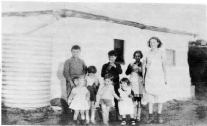
At the Mt Monger school.