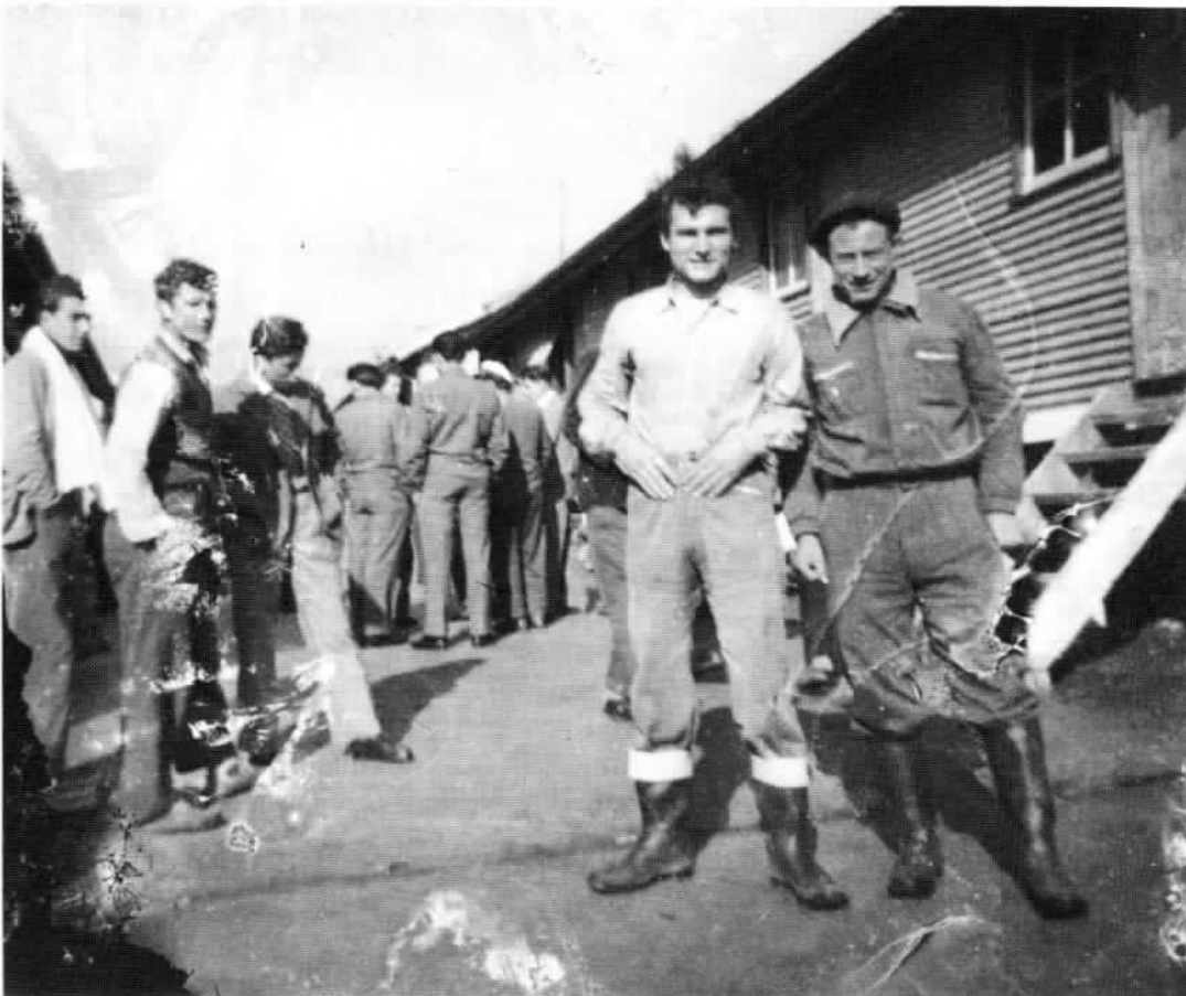
A group of Italian immigrants at the Bonegilla Migrant Centre in 1952.

It is with some pride that I was imprisoned for telling the truth.