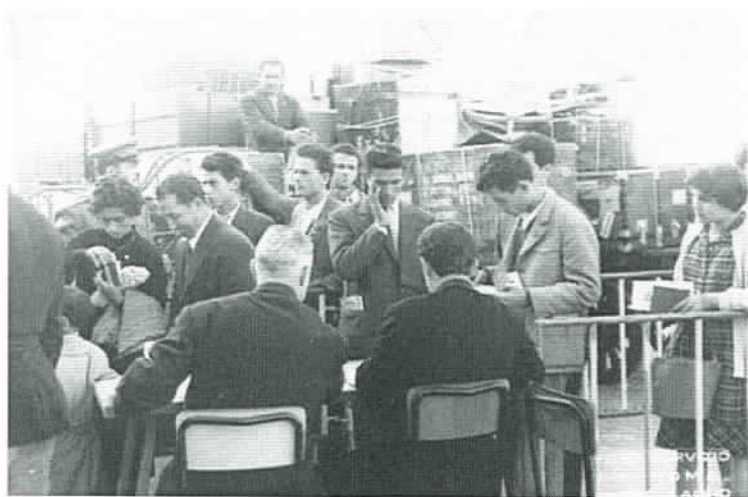
Migrants from Caulonia at the port of Messina, waiting to embark for Australia, c. 1960.

As late as the 1950s, in spite of massive intervention by the Italian State through the Cassa per il Mezzogiorno (State Fund for the South), Calabria remained one of the most underdeveloped regions in Italy and, with its social and economic problems, became known as l'area depressa (the depressed area). In 1951, a quarter of the population was still illiterate, two-thirds of the labour force were employed in agriculture and a third of families (the highest in Italy) lived in poverty. 4 Between 1950 and 1953, with a yearly average of 18,000 departures, Calabria was the Italian region with the highest level of migration to overseas destinations. 5 The migration of Italians towards Canada and Australia almost doubled that of the United States: this was in part due to the restrictive legislation introduced in the US in the 1920s, and to the launch of mass immigration programs by the Canadian and Australian governments.