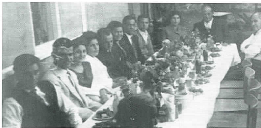
Engagement party at the Nesci family home in Strano, hamlet of Caulonia, 1961.

The unfair treatment women were subjected to made them aware of the contradictions of their own patriarchal upbringing and of its inherent double standards. Thus, the women have sometimes become mediators between the authoritarian behaviour of their