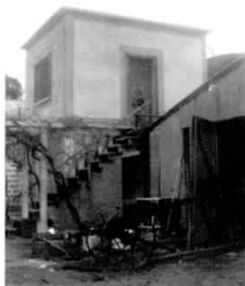
This concrete and brick storage building on 'Garnock' was one of a number built by the POWs. All work had to be approved by the authorities, ensuring the POWs were not engaged in 'trivial' tasks.

The Italians I have employed are hard-working, cheerful men, who learn quickly and do not worry about hours, but the average Australian farm worker, nowadays, works for a few days a week for 25 or 30 shillings or more a day and then knocks off. Italian war prisoners in my district and other country districts have saved the day for the farmers. 12