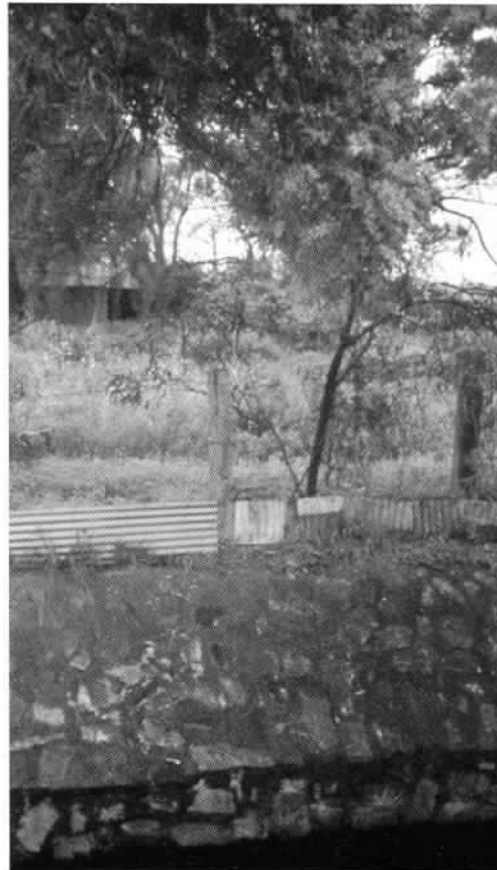
BOTTOM A plot of land on the walls at Altavilla Irpina, Campania.