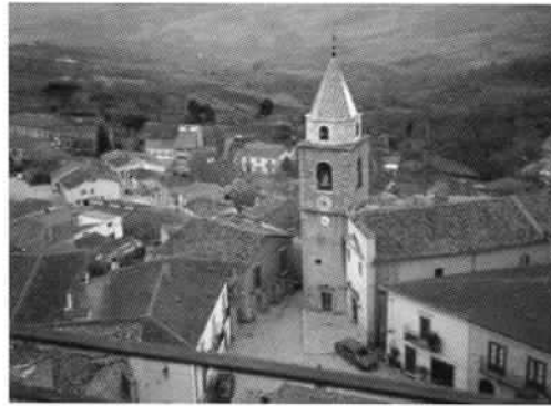
MIDDLE Townscape of San Marco dei Cavotti, Campania showing dense housing, piazzas and proximity of agricultural land.