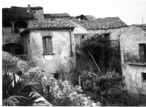
TOP View of multi-level stone dwellings forming the walls of Southern Italian hill-towns.

Principally these peasant workers, or paesani of town or village, received wages for summer harvesting work from the owners of large farms, some nearby and others a truck ride and a weeks stay away. There was some further work in road making and transport services for men, tomato canning and infrastructure work for women, mostly in the snow free months and on a casual basis. Overall then, work in the formal economy was limited to the summer season and a surrounding few weeks or months. The cash component or formal economy was important, but the greatest dependence overall was on the domestic and informal economy, the home and bartering system of the village economy. 4 For example, 'Four ceramic pots could equal half a goat' (Fieldwork visit, 1997). Where townhouse rents were defrayed against summer harvesting work by wealthy landholders, many workers had little access or experience of the formal economy, living in an almost feudal style. For them bartering and markets had increased importance as the only place for them to make cash transactions.