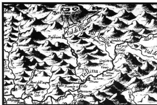
Map of mid Valtellina.

From the discussion above, there were probably at least 53 Italians living at Okura in 1877. By 1880, there were none. These figures illustrate the precipitate collapse of the ‘Special Settlement’ at Jackson’s Bay. Adriano Boncompagni in a recent issue of this journal has written of this settlement as have others 11 . That it should ever have been attempted was the triumph of the parochial ‘boosterism’ of the Westland Provincial Government over reality. In 1875 when the first settlers arrived in this remote and desolate corner of Westland, the area destined for settlement was covered with dense bush. It also had one of the heaviest rainfall figures in all of New Zealand — about 380 cm per year. Furthermore, the only communication was by sea and the anchorage was exposed to the west, which is the direction of the prevailing wind. Okura is about 25 km north along the beach from Jackson’s Bay itself. The journey would have involved the fording of several rivers, notoriously liable to sudden flooding. Consequently essentially all communication with Okura was by sea on a coast