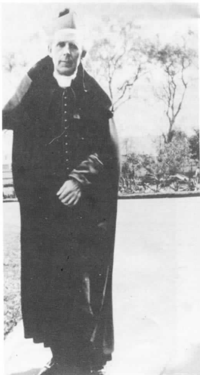
Archbishop Mannix, c1940.