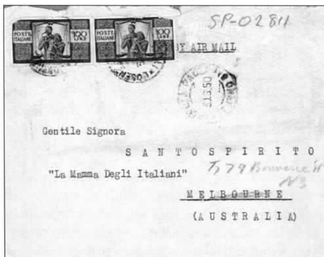
One of the many letters addressed to 'La Mamma degli Italiani, Melbourne'.