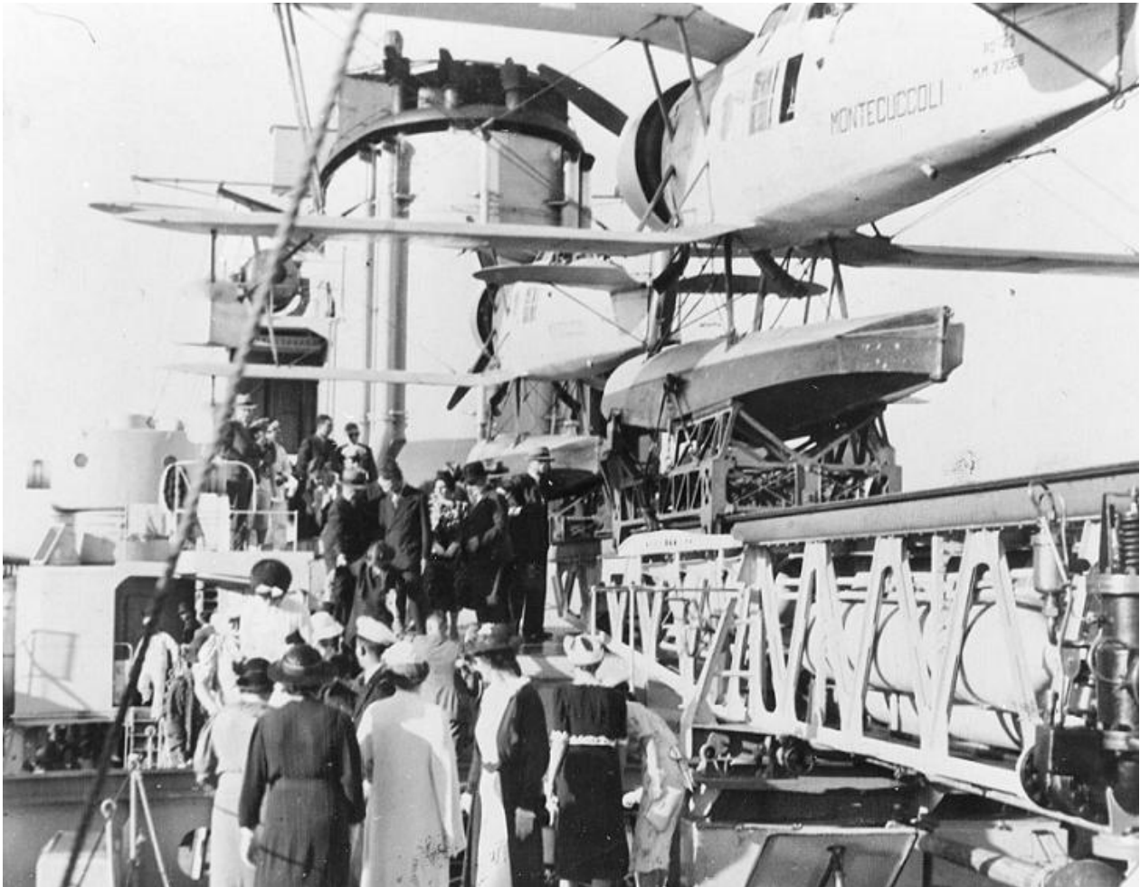
The Italian cruiser Raimondo Montecuccoli during its controversial visit to Melbourne in 1938.

them immediately in case they tried to re-enter Italy. In extreme circumstances, diehard opponents had their Italian citizenship revoked and their property confiscated by the authorities under special law no. 108, promulgated on 31 January 1926 (18).