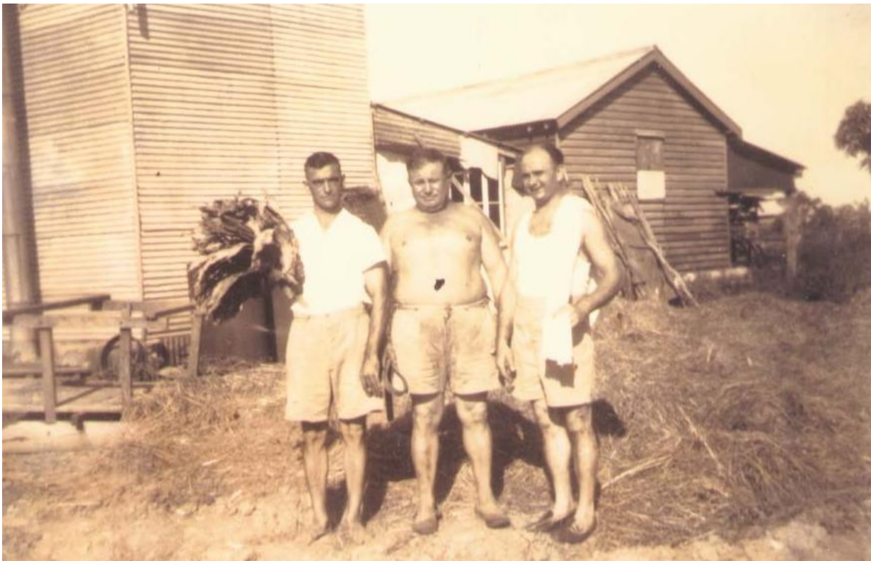
Italian migrants at work on a tobacco plantation. Mareeba, c.1933.